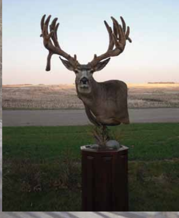
Taxidermy Work By Rion White Orion Taxidermy Moose Jaw SK